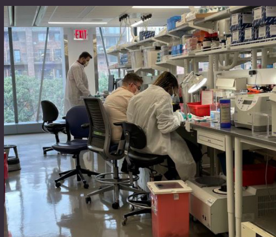
Lab team working in the interim space, in the Lab Medicine building (room 411, pre-PCR bay)

Having just gone through a move themselves, the Orlow lab shows that life goes on!