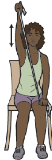
Figure 7. Pull band over head