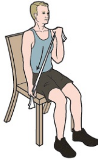
Figure 5. Straighten arm