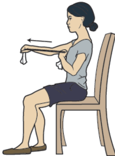
Figure 1. Forward punches