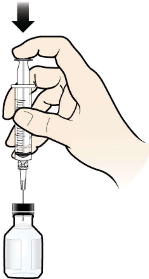
Figure 1. Injecting air into the vial

Hold the syringe with the hand you use to write with and the vial with your other hand. Don't let go of the vial, or the needle will bend. Make sure the tip of the needle is in the medication. Rotate the syringe so you're looking at the numbers and lines on the syringe.