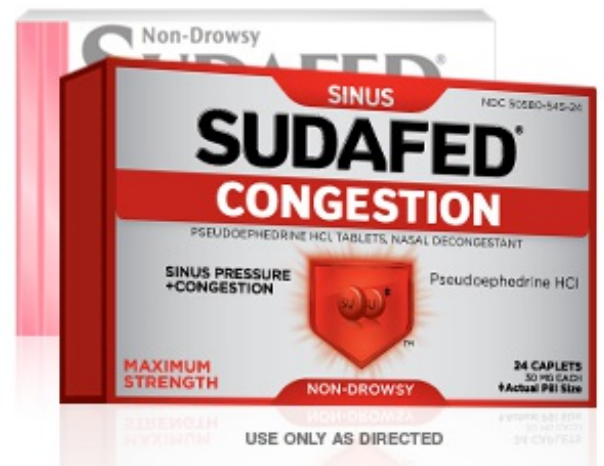
Figure 4. Pseudoephedrine HCl

Make sure to have pseudoephedrine HCl with you as long as you're using the penile injections.